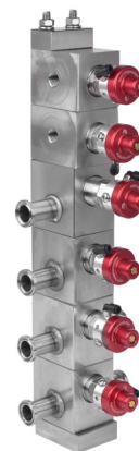
High Flow Color Stack